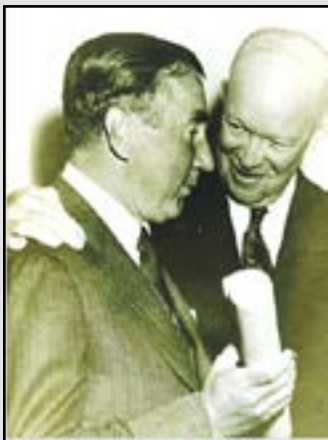
White House, March 1, 1950: William Harding Jackson, U.S. National Security Advisor and President Dwight D. Eisenhower

William Harding Jackson was born on March 25, 1901, on the Belle Meade Plantation. He was named for his father, William Harding Jackson, who died when he was two years old. Jackson attended Fay School in Boston, which was an Episcopal Preparatory School.