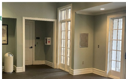
AED in lobby

We recently moved an AED from the Police Department into the main lobby of City Hall. This allows the AED to be accessed by any person in the building in the event of an emergency. It is located immediately outside the Board Room at City Hall and will be on your right as you enter the building. Commissioners recommended this improvement during their annual retreat in February.