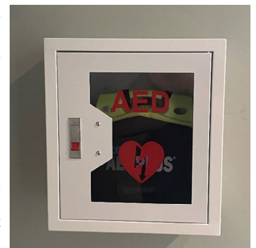
AED close up