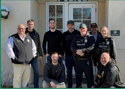
PD with Germans

We never know who will stop by and visit. On March 6th, five police officers from the towns of Oberviechtach and Roth, in Bavaria, Germany stopped by the Belle Meade Police Department. They were visiting Nashville and decided to check out our police facilities. We