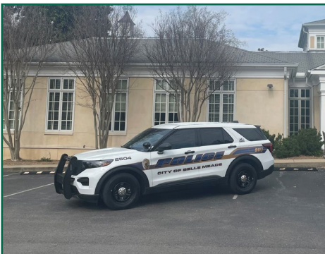
New Patrol Car

At the February Board of Commissioners meeting, the Belle Meade Mayor and Commissioners approved the purchase of seven new police vehicles, consisting of four patrol vehicles and three unmarked vehicles. These vehicles will replace the last few Dodge Chargers in