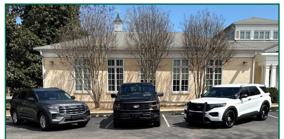
New Unmarked Cars

the full-time fleet, which have high milage and have experienced several mechanical issues over the past year. Six of the new vehicles are already on the street, and the seventh is scheduled to be delivered by mid-April. This was a much-needed upgrade, and they will be a great addition to our fleet. Several of the Dodge Chargers will be auctioned off in May of this year.