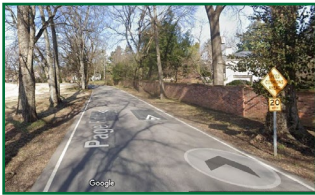
Page Rd Speed Cushions

Page Road, Leake Avenue, and Lynwood Boulevard are all local roads that have recently been involved in traffic calming studies completed under the Neighborhood Street Traffic Calming (NSTC) Program Team of the Nashville Department of Transportation (NDOT). In each case, the study is possible because