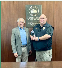
Chief and Mayor with IACP safety award