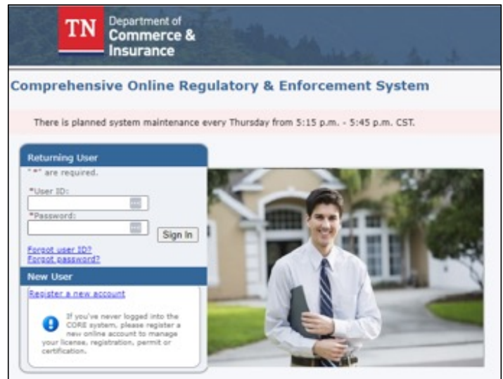
CORE - Comprehensive Online Regulatory and Enforcement System; https://core.tn.gov

Direct links and additional information are available on the City’s website, citybellemeade.org , under Building and Codes.