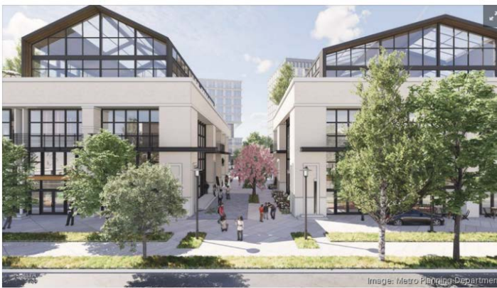
AJ Capital seeks to redevelop over 10 acres of land in Belle Meade. METRO PLANNING DEPARTMENT